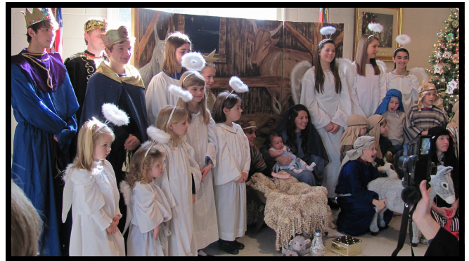
Christmas Pageant 2010